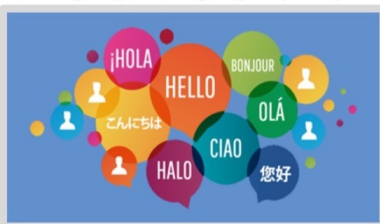
Registry of Dialects (ROD)