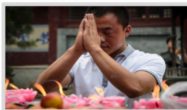
Registry of Religions (ROR)