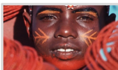
Registry of Peoples (ROP)