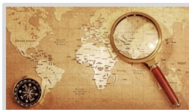
Registry of Geography (ROG)

Things often move slowly in the area of data standards, but rest assured that the HIS editors will continue their patient, careful and long-term work on your behalf.